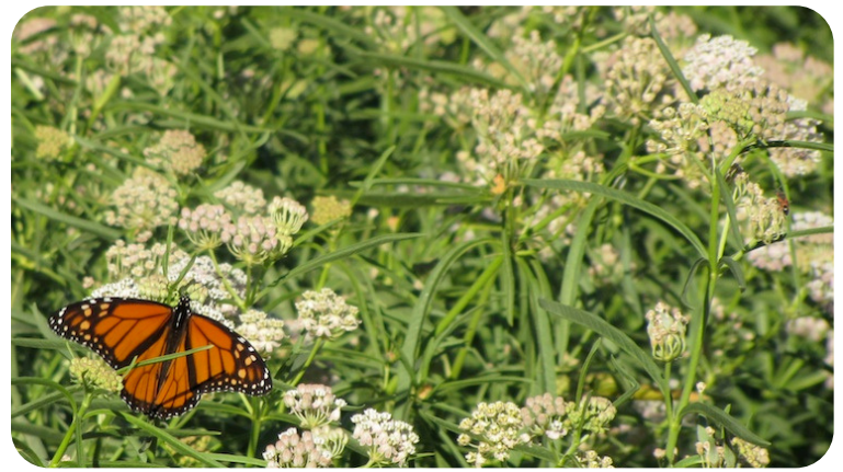
Monarch butterfly on narrowleaf milkweed ( Asclepias fascicularis )

Common milkweeds native to the West include narrowleaf milkweed ( Asclepias fascicularis ), showy milkweed ( A. speciosa ), woollypod milkweed ( A. eriocarpa ), and heartleaf milkweed ( A. cordifolia ). In California, A. californica , A. subulata , and A. erosa are also important host plants. Be sure to check which milkweed and nectar plants are native to your region. North of Santa Barbara, avoid planting milkweeds within 5-10 miles of coastal monarch overwintering sites. Instead, plant plenty of native flowering plants, especially those that bloom in early spring. More info at www.monarchjointventure.org/resources/downloads-and-links .